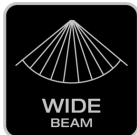
Wide Beam Pattern

For a large-area and wide light distribution