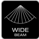
Wide Beam Pattern

For a large-area and wide light distribution