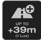
Up to 39 m long beam

For a large-area and wide light distribution