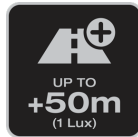
Up to 50 m long beam

For a large-area and wide light distribution