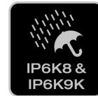
IP & IK protection classes

Matched to individual requirements and needs for versatile applications